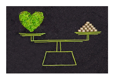
Social Finance New Crypto

Now with offices in London, Kochi, New York, Shanghai, Tokyo, Zurich