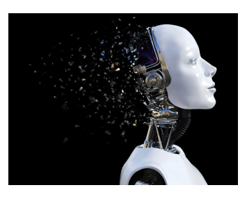
Al Bot Wallet App Al phone bot based on

Head of Chinese Seratio Blockchain Community leads UK£ 2.5 million investment